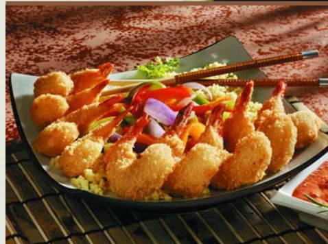
GOLDEN SUPREME ROUND