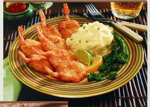
GOLDEN SUPREME BUTTERFLY

To Order, Contact Your King & Prince® Sales Representative or Call 1-800-841-0205.