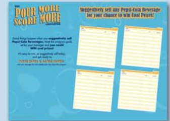
Crew Tracking Poster